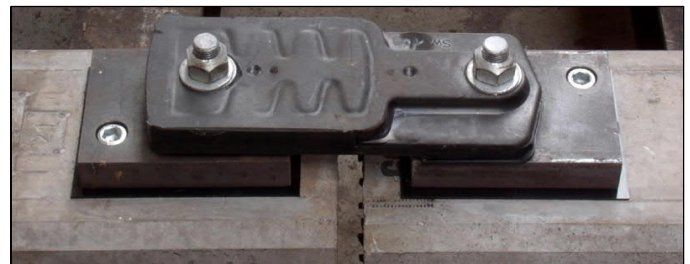
Elastic coupling with adapter plate for concrete sleeper with dowel fastening (Swt 10)