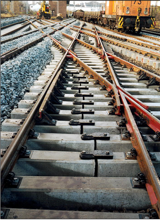
Elastic couplings in a diamond crossing installation