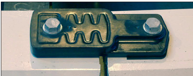
Elastic coupling for concrete sleeper with through bolt connection (Swt 7)