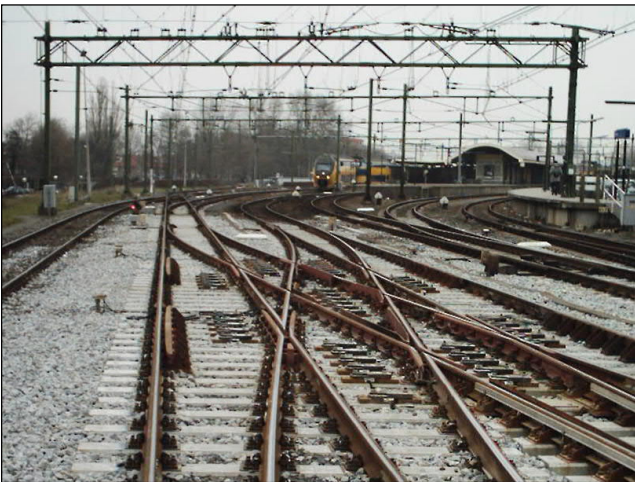
Elastic couplings with adapter plates in a complex track installation