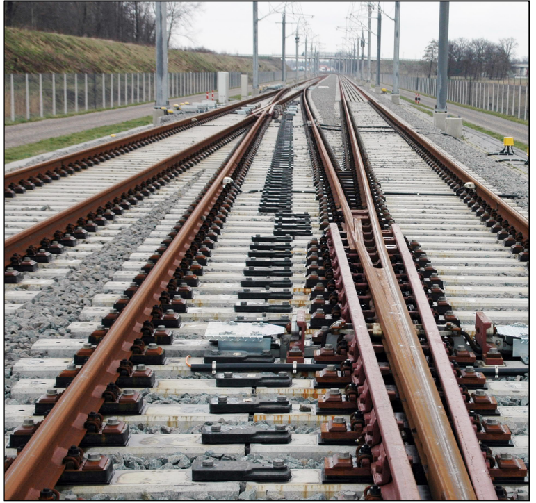
Crossover with bi-block long sleepers and elastic couplings