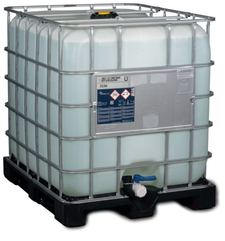
1200 kg IBCs