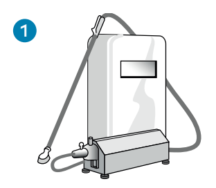
1. Apply all chemicals by using an acid resistant pump like Avesta SP 25. Start with pre-cleaning to remove oil and grease by using Avesta Cleaner 401 and then rinse off with water.