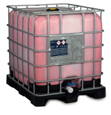
1200 kg IBCs