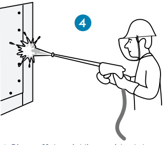
4. Rinse off the pickling residuals by using a high-pressure water jet. Use deionized water for the final rinsing of sensitive surfaces. The waste water should be neutralized before discharge.