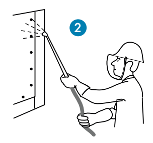
2. Stir the pickling spray before usage. Apply with SP 25 and spray evenly over the entire surface.