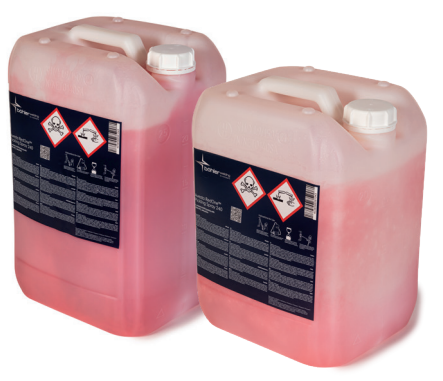
Photos: Available in several packages (Sizes may differ from markets)