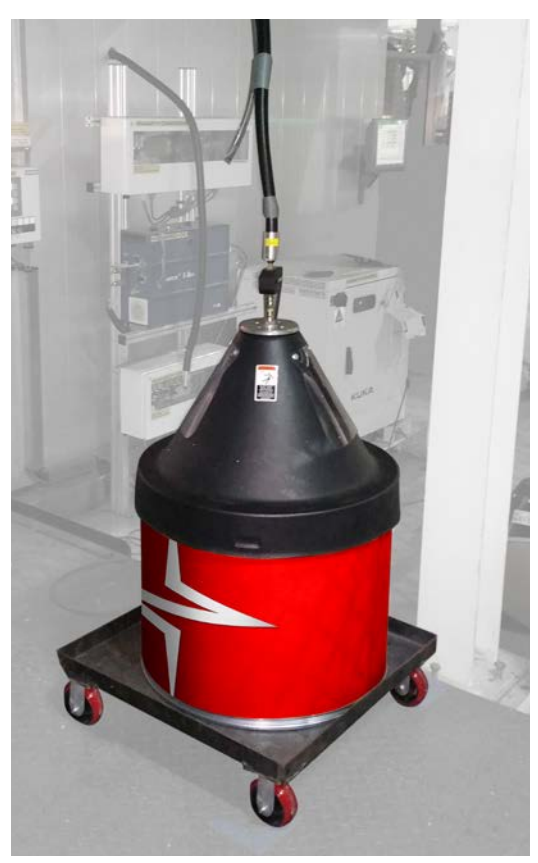
200 kg drum with wire feeding system