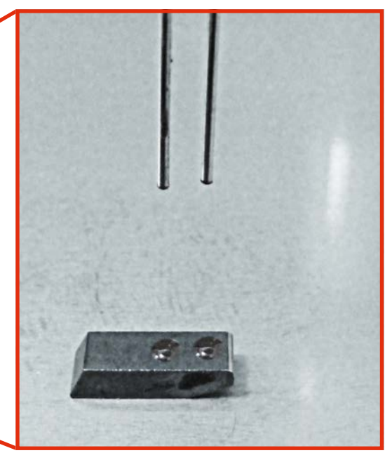
Tungsten carbide saw tooth: Flux paste F 300 DS 12 applied to a tungsten carbide surface